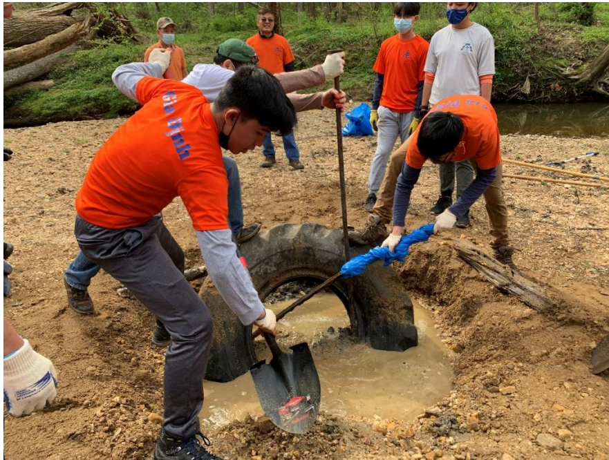
The crew of Troop 702 drives their harpoons into Moby Tire