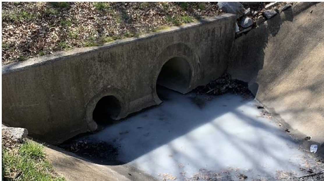
Opaque white discharge – never a good sign

Illegal Discharge: On March 29 Philip noticed an opaque white discharge coming from a storm drain along Telegraph Road in Lorton. I used our Watershed 911 page to call Stormwater Planning. An inspector came out right away and traced the source to a nearby marble cutting operation. The business was ordered to stop, and as usual, there was no penalty.