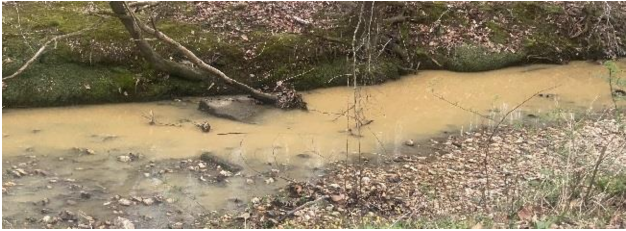
Daniels Run filled with sediment from the water main break